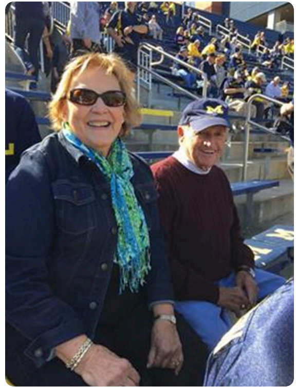
The Big House October 2015